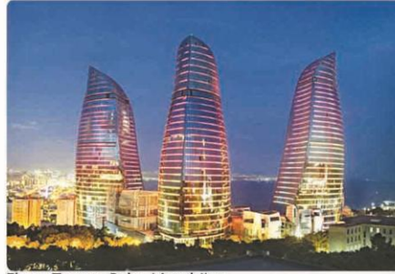
Flame Towers, Baku / Azerbaijan