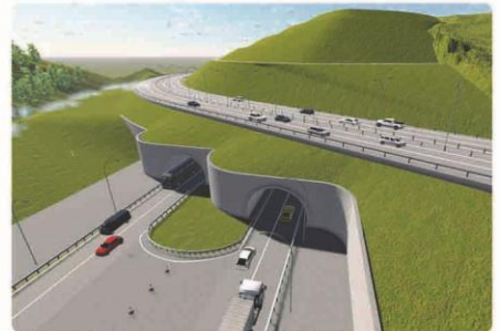
Sabuncubeli Tunnel, Izmir, Manisa / Turkey