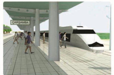
Samsun - Fatsa Railway, Turkey