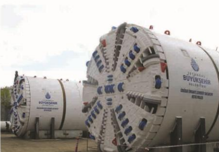
Uskudar - Umraniye - Cekmekoy Metro, Istanbul / Turkey