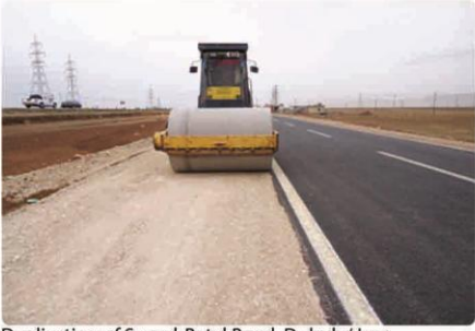
Dualization of Sumel-Batel Road, Duhok / Iraq