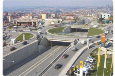
Kavacik - Beykoz Highway, Istanbul / Turkey