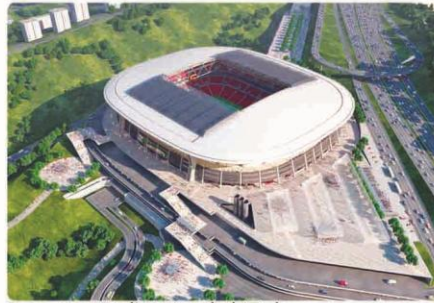
Seyrantepe Stadium, Istanbul / Turkey