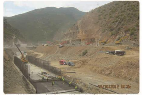
General Directorate of Highways 10th Regional Directorate Highways, Trabzon, Giresun, Rize, Artvin, Gumushane, Bayburt / Turkey