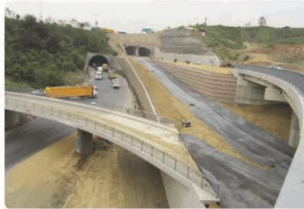
Hasdal Junction-Kemberburgaz-Yassioren Highway, Istanbul / Turkey