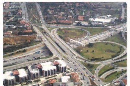
Interchanges and Roads Projects Throughout Istanbul, Turkey