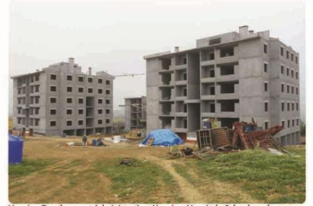
Housing Development Administration, Housing, Hospitals, Schools and Buildings, Balikesir, Bilecik, Bolu, Bursa, Kocaeli, Kutahya, Sakarya, Yalova, Amasya, Corum, Samsun, Tokat / Turkey