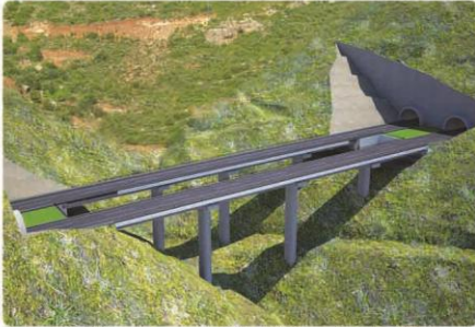
Erdemli -Silifke - Tasucu - 13th Division Border Highway, Mersin / Turkey