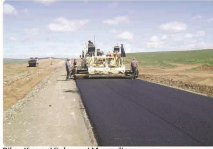
Bilge Kagan Highway / Mongolia