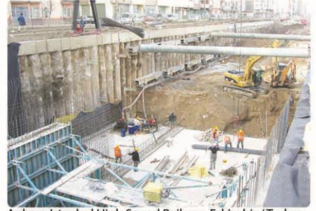
Ankara-Istanbul High Speed Railway, Eskişehir / Turkey