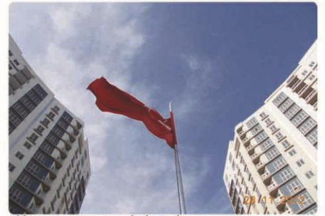
Akkoza Housing, Istanbul / Turkey