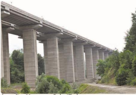
Anatolian Motorway, Bolu / Turkey