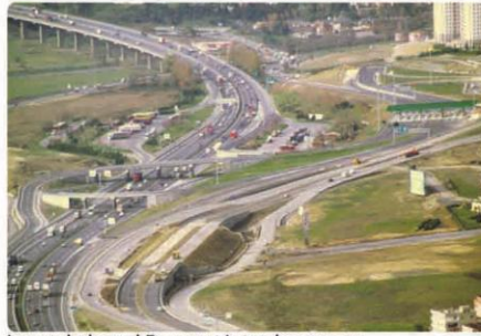
Ispartakule and Esenyurt Interchanges on O-3 Motorway, Istanbul / Turkey