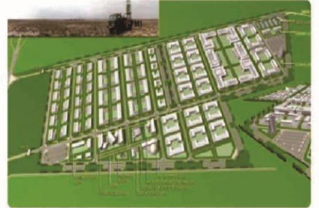
Organized Industrial Zone, Baku / Azerbaijan