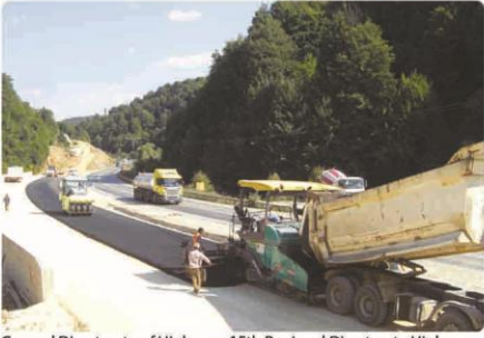
General Directorate of Highways 15th Regional Directorate Highways, Zonguldak, Bartın, Karabük, Kastamonu / Turkey