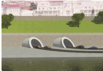
Kasimpasa - Sutluce Tunnels, Istanbul / Turkey