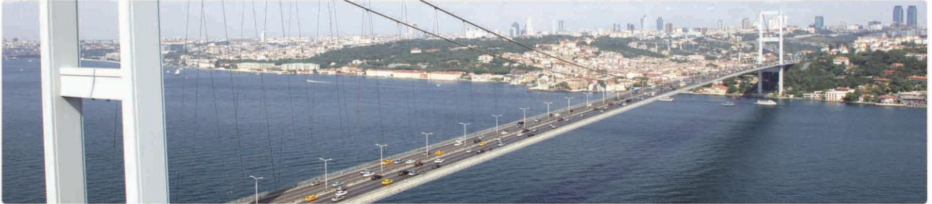
Strengthening of Large Scale Bridges Against Earthquake, Istanbul / Turkey