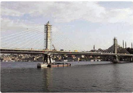
Halic Metro Crossing Bridge, Istanbul / Turkey