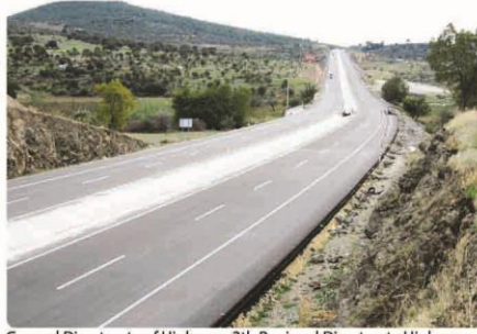
General Directorate of Highways 2th Regional Directorate Highways, İzmir, Aydın, Muğla, Uşak, Manisa, Denizli / Turkey