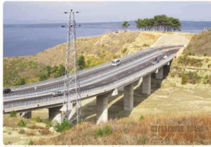
General Directorate of Highways 14th Regional Directorate Highways, Bursa, Balıkesir, Bilecik, Canakkale, Kutahya, Yalova / Turkey