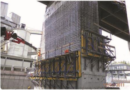
Anatolian Motorway Seismic Retrofit of Structures, İstanbul, Kocaeli, Adapazarı / Turkey