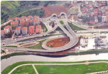
Piyalepasa Tunnel, Istanbul / Turkey