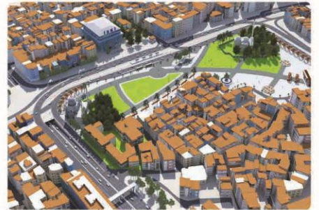
Aksaray Square, Istanbul / Turkey