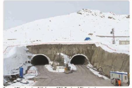
General Directorate of Highways 10th Regional Directorate İkizdere - İspir Road Ovit Tunnel and Connection Roads, Rize, Erzurum / Turkey