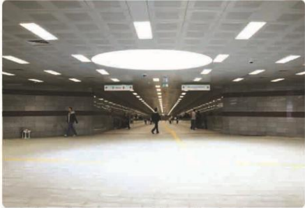
Pedestrian Underpasses and Zonal Roads of Mecidiyekoy Transfer Center, Istanbul / Turkey