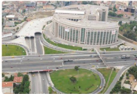
Caglayan Square, Istanbul / Turkey