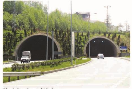
Black Sea Coastal Highway, Trabzon, Rize, Artvin / Turkey