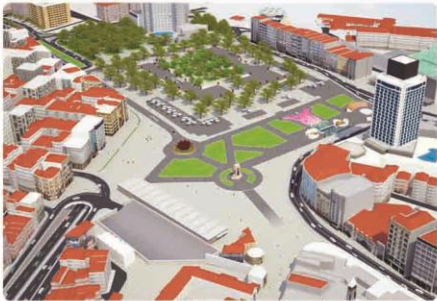
Pedestrianization of Taksim Square, Istanbul / Turkey

n o r t h m a r m a r a m o t o r w a y including 3rd B o p h o r u s B r i d g e