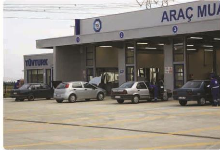
TUVTURK Vehicle Inspection Centers , Turkey