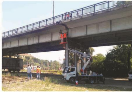
Seismic Retrofit of Various Transportation Structures Throughout İstanbul, İstanbul / Turkey