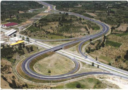
Bursa Peripheral Motorway, Bursa / Turkey