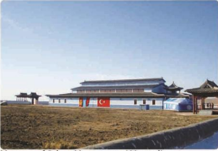
Museum of Orhun Monuments / Mongolia